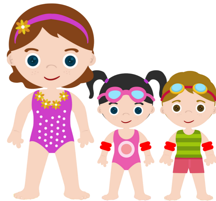
Oedolyn 16+ a hyd at 2 o blant rhwng 4-7 oed Adult 16+ and up to 2 children 4-7 yrs