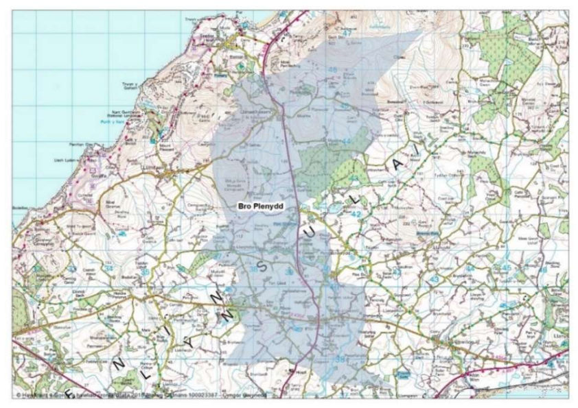
Map 2: Ysgol Bro Plenydd catchment area if changes take place