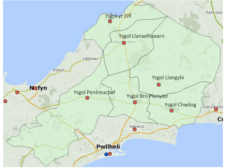
The location of schools in the Llanaelhaearn area

The catchment areas of four nearby primary schools adjoin the Ysgol Llanaelhaearn catchment area, namely Ysgol Yr Eifl, Ysgol Llangybi, Ysgol Bro Plenydd and Ysgol Pentreuchaf. In addition, as Ysgol Chwilog is nearby, and the two schools currently collaborate and share a headteacher, information on Ysgol Chwilog is also included in this section, as it would be reasonable to consider that pupils may wish to transfer to this school.