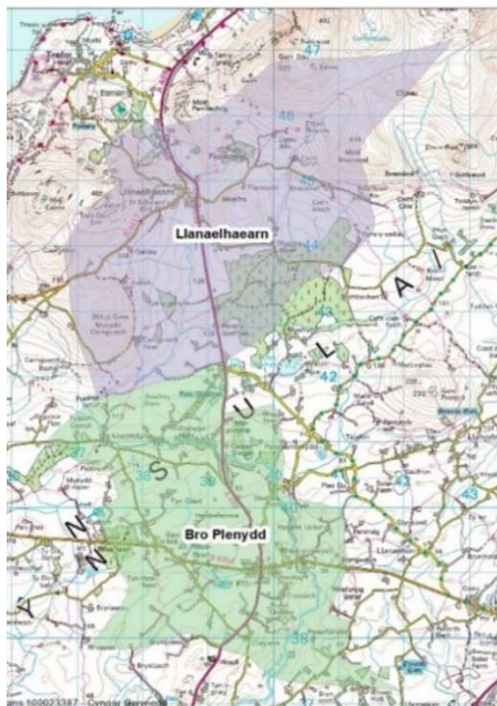
Map 2: Ysgol Bro Plenydd catchment area if changes take place