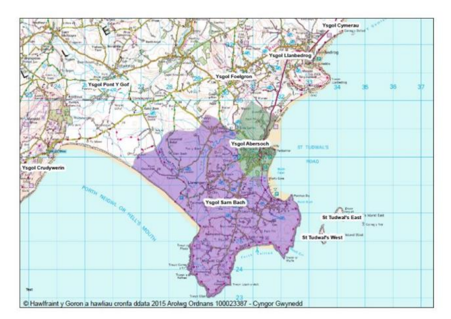
Map 1: Current situation of the area's catchment areas

If the proposal is implemented, the catchment area of Ysgol Sarn Bach would be adapted to include the area of the existing school, as well as the existing catchment area of Ysgol Abersoch.