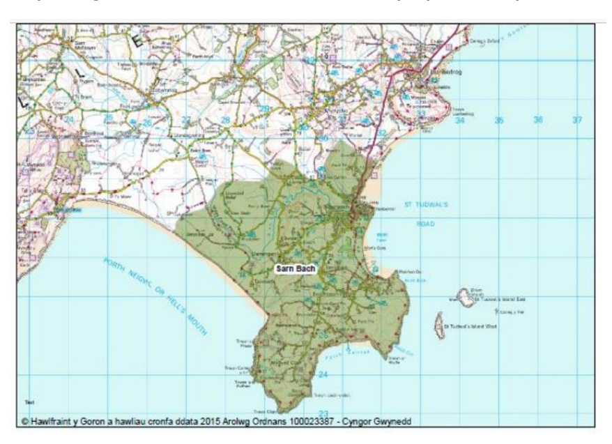
Map 2: Ysgol Sarn Bach catchment area if the proposal is implemented