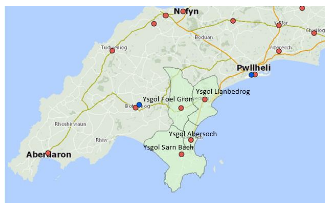
1 The locations of schools in the Abersoch area

The Ysgol Abersoch catchment area adjoins with the catchment area of 3 nearby primary schools, namely Ysgol Sarn Bach, Ysgol Foel Gron and Ysgol Llanbedrog.