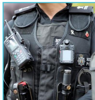
Swyddog Heddlu / Police Officer

As the Police and Crime Commissioner for North Wales one of my main responsibilities is to set the annual precept, which is the part of the policing budget that is raised from local taxes. The level of the precept determines the total budget available for policing in North Wales, and its importance to the quality, effectiveness and efficiency of policing in North Wales cannot be overstated in making North Wales the safest place in the United Kingdom.