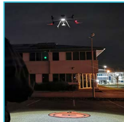
Uned Drôn / Drone Unit

Comisiynydd Heddlu a Throsedd Gogledd Cymru North Wales Police and Crime Commissioner